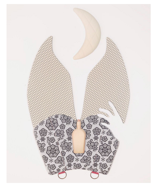
Trish Tillman Night Lite, 2024 UV print on nappa leather, vegan leather, wood, foam, metal hardware, hydrocal, polymer clay, acrylic 39h x 23w x 2.50d in