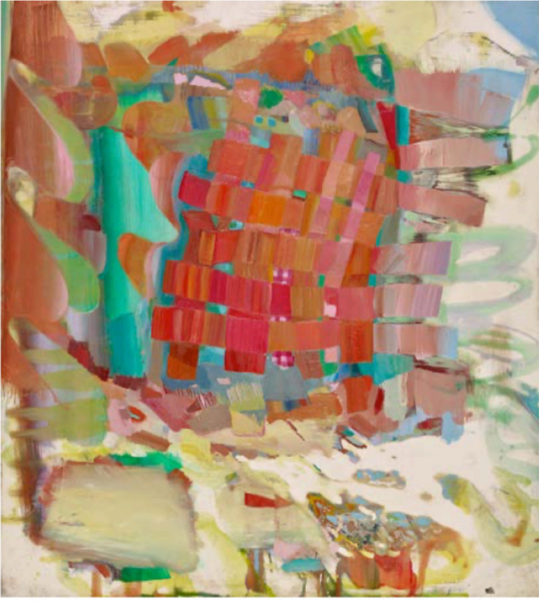
Gingham Heart oil on panel 18" x 20"