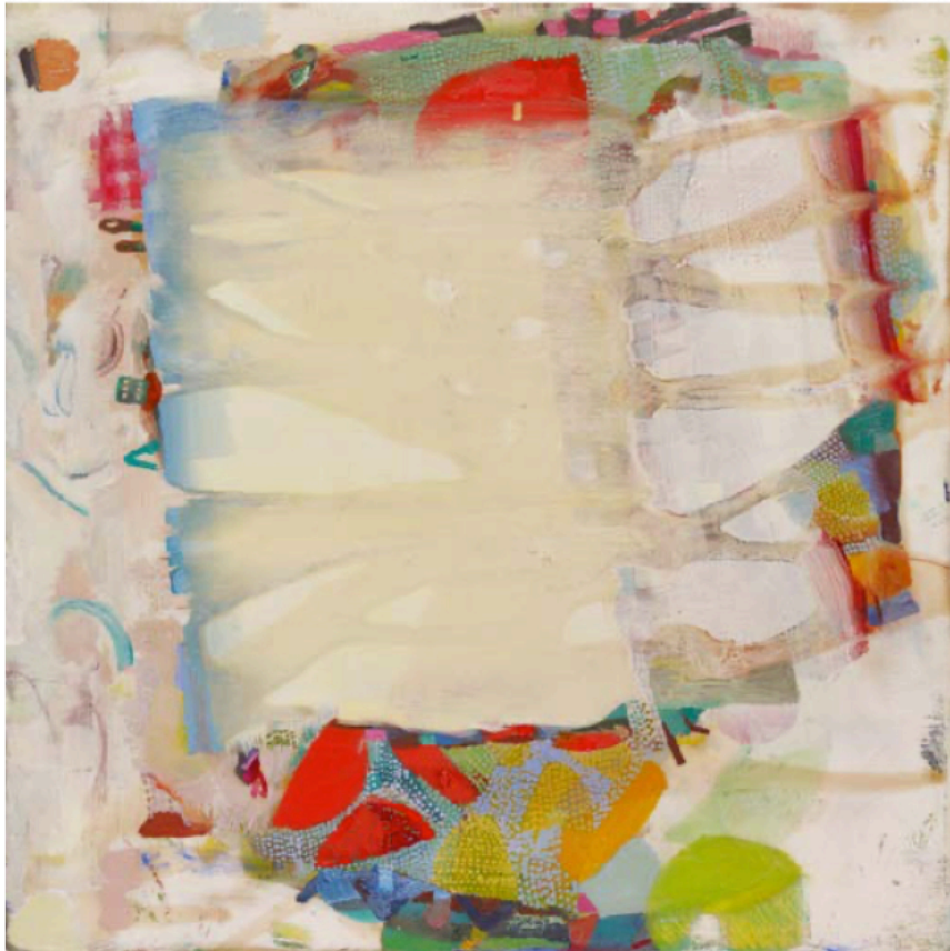
Morning Drive In oil on panel 12" x 12"