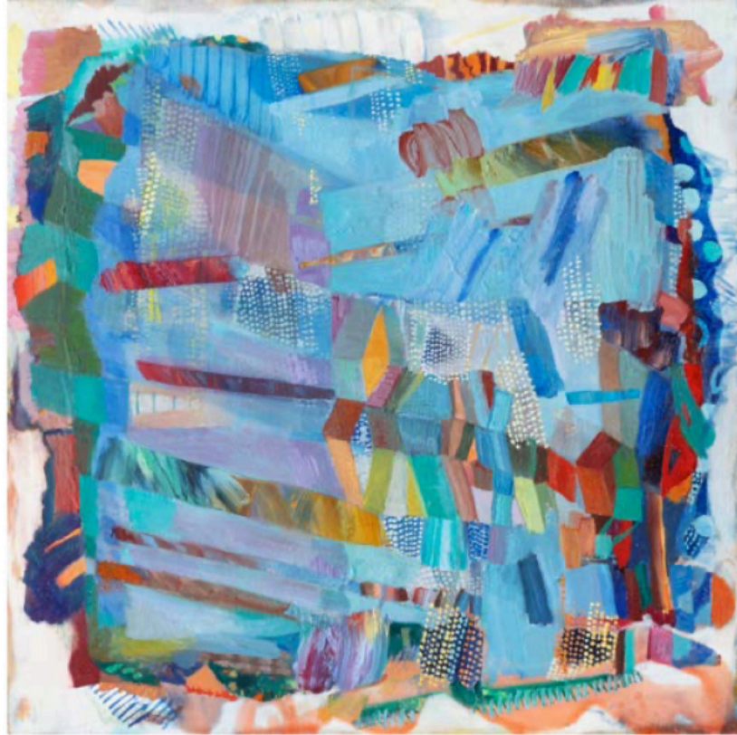
Book Water oil on panel 12" x 12"