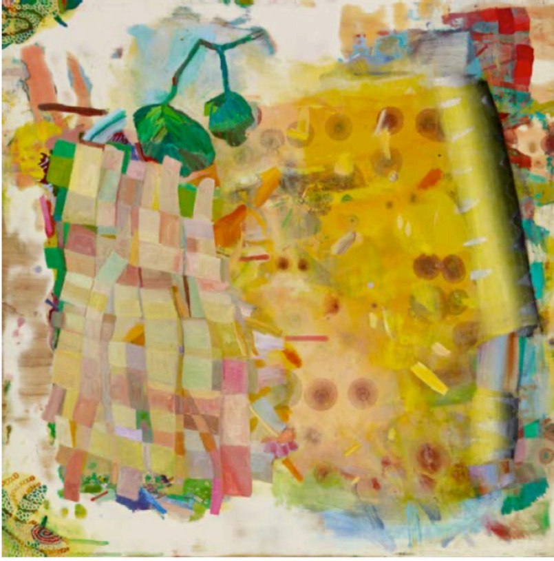
Sunspot oil on panel 24" x 24"