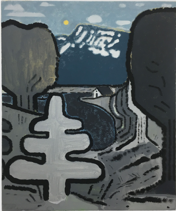
Brian Scott Campbell, Blue Mountain , Flashe on canvas, 20 x 16" (50.5 x 40.5 cm), 2019