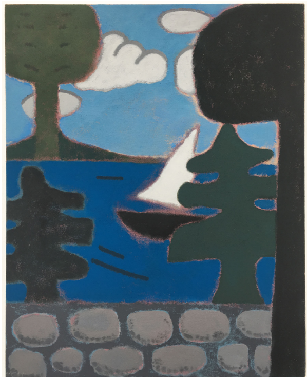
Left: Brian Scott Campbell, Harbor , Flashe on canvas, 20 x 16" (50.5 x 40.5 cm), 2019. Right: Brian Scott Campbell, Sail Away , Flashe on canvas, 20 x 16" (50.5 x 40.5 cm), 2019