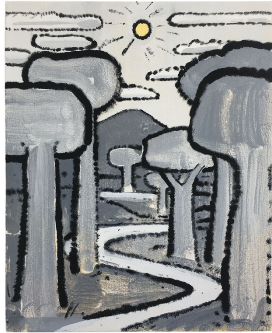
Left: Brian Scott Campbell, Little House , Flashe on canvas, 20 x 16" (50.5 x 40.5 cm), 2019. Right: Brian Scott Campbell, Guiding Light , Flashe on canvas, 20 x 16" (50.5 x 40.5 cm), 2019.