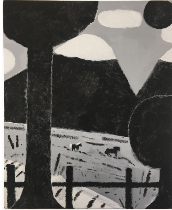
Left: Brian Scott Campbell, Two Blue Trees , Flashe on canvas, 20 x 16" (50.5 x 40.5 cm), 2019. Right: Brian Scott Campbell, Black Hole Sun , Flashe on canvas, 20 x 16" (50.5 x 40.5 cm), 2019.