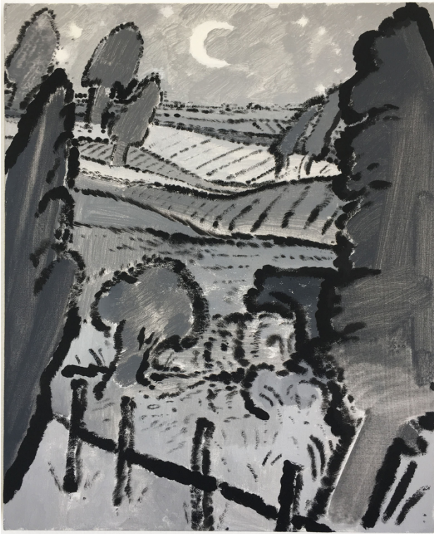
Brian Scott Campbell, Moon , Flashe on canvas, 20 x 16" (50.5 x 40.5 cm), 2019

https://artviewer.org/brian-scott-campbell-at-harbinger-project-space/