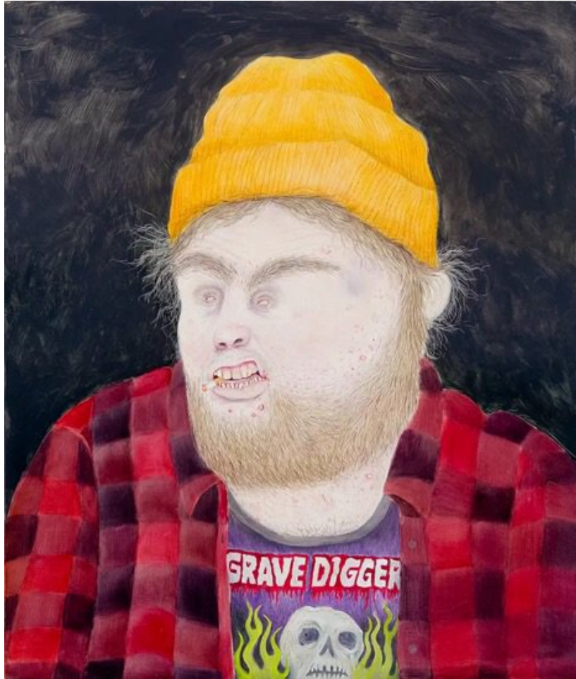
Hunter or Hipster, Male, 2012