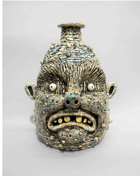
Frowny Jug, 2014