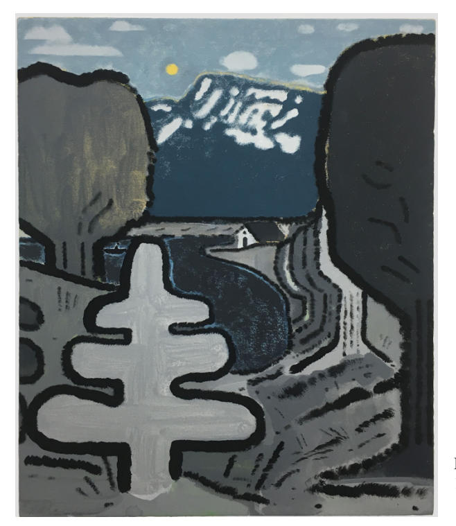
Brian Scott Campbell, Blue Mountain , Flashe on canvas, 20 x 16" (50.5 x 40.5 cm), 2019