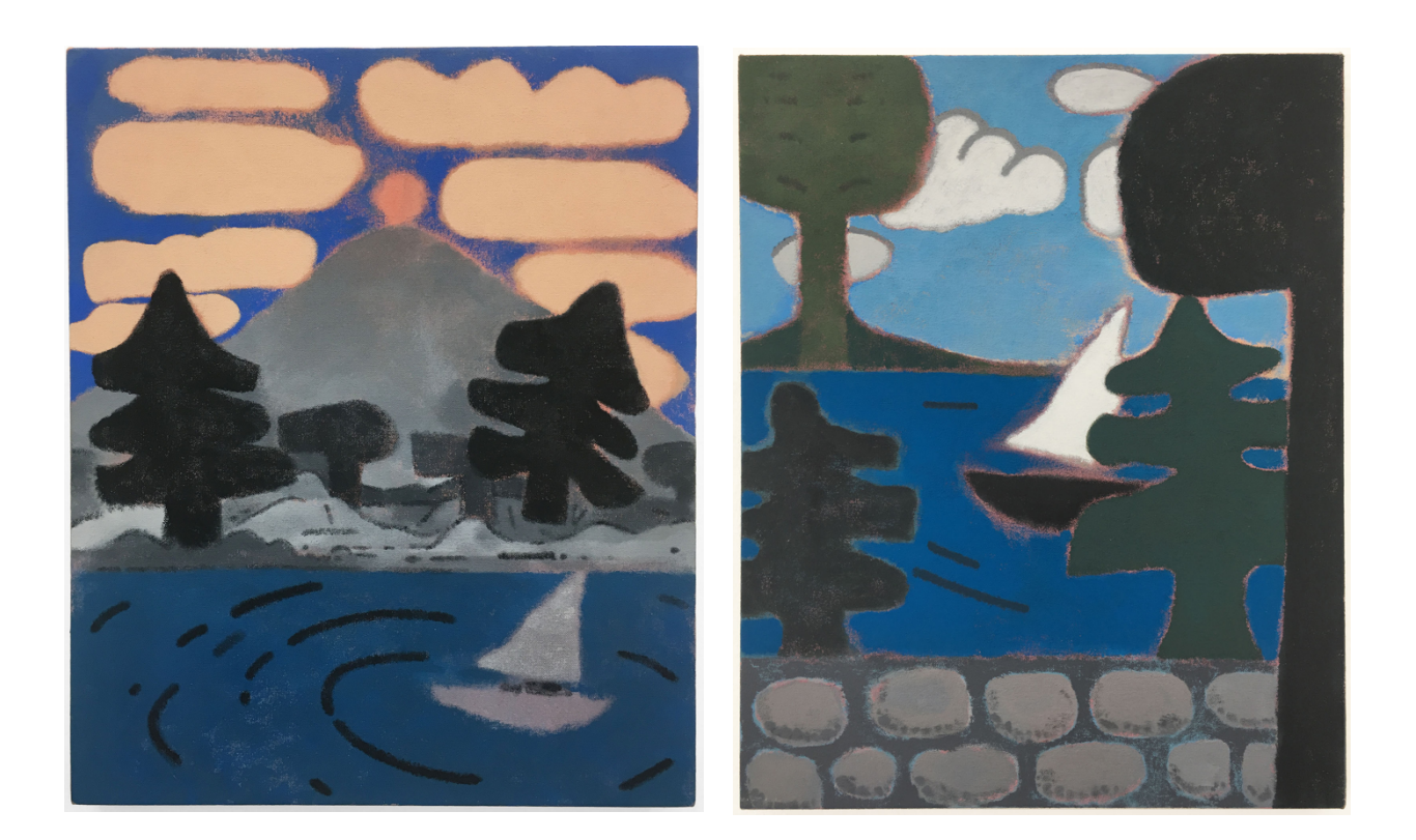
Left: Brian Scott Campbell, Harbor , Flashe on canvas, 20 x 16" (50.5 x 40.5 cm), 2019. Right: Brian Scott Campbell, Sail Away , Flashe on canvas, 20 x 16" (50.5 x 40.5 cm), 2019