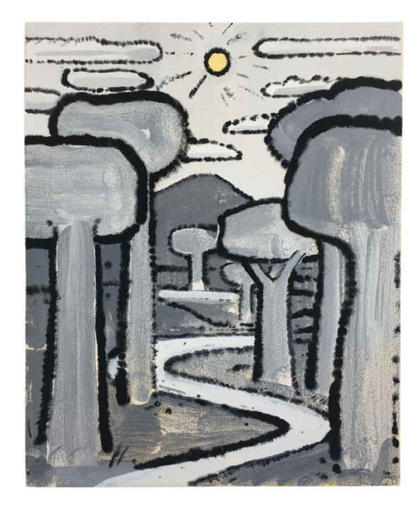
Left: Brian Scott Campbell, Little House , Flashe on canvas, 20 x 16" (50.5 x 40.5 cm), 2019. Right: Brian Scott Campbell, Guiding Light , Flashe on canvas, 20 x 16" (50.5 x 40.5 cm), 2019.