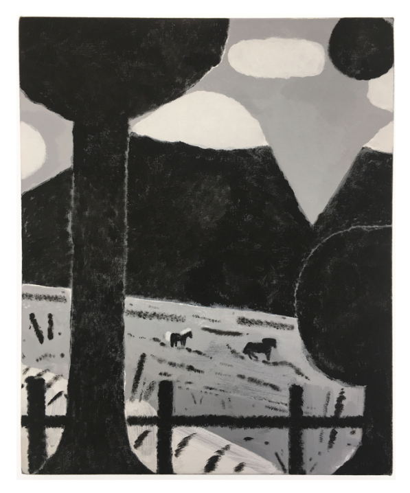
Left: Brian Scott Campbell, Two Blue Trees , Flashe on canvas, 20 x 16" (50.5 x 40.5 cm), 2019. Right: Brian Scott Campbell, Black Hole Sun , Flashe on canvas, 20 x 16" (50.5 x 40.5 cm), 2019.