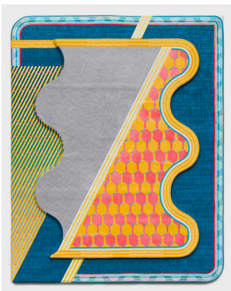
Mark Joshua Epstein, "Pulling Threads on Other People's Sweaters," 2022, acrylic on artist made resin/fiberglass panel, 35.50 x 28.50 x 2 inches, photo by Etienne Frossard, courtesy of the artist and Asya Geisberg Gallery.

MJE: I knew when I started to dream up ideas for three-dimensional paintings that I didn't want to make the supports in a woodshop. It was a question of flexibility—I needed to create panels in a manner that would allow me to change my mind, refine my forms, and easily add and subtract. I wanted to start with a material I could cut with a box cutter, and so that was going to be some kind of foam. For a few years I worked with green insulation foam and covered it in epoxy clay, but it was wildly laborious. When I made the choice to scale the work up for a show at Ortega y Gasset in Brooklyn, I knew I was going to have to switch support materials. That's when I started researching resins and fiberglass.