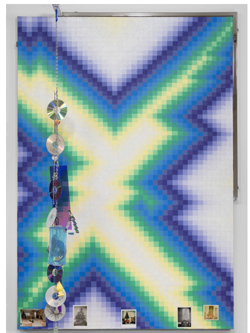
Personal Setting, 2020 Oil paint, house paint, photographs of xmas trees, chrome plated steel, chain, various hardware, CDs with images of my past work, plastic rooster, various lapel pins, purple plexiglass, xmas cookie cutter, plastic storage box, Disney Goofy figurine, ceramic nativity figurine, bottle of Hendricks gin, multi-tool key chain, door closure hardware 73" x 51" x 12"