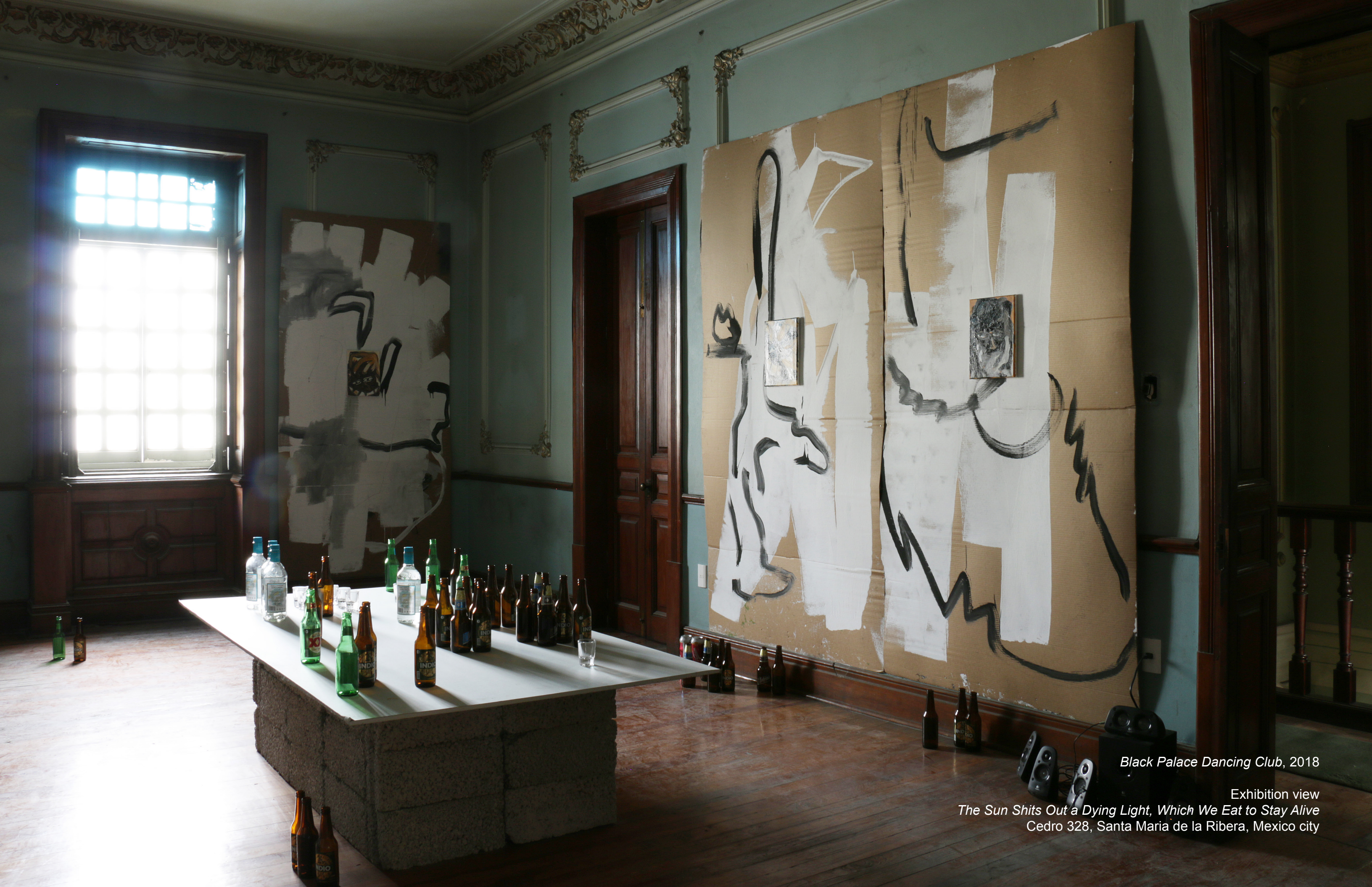
Black Palace Dancing Club, 2018