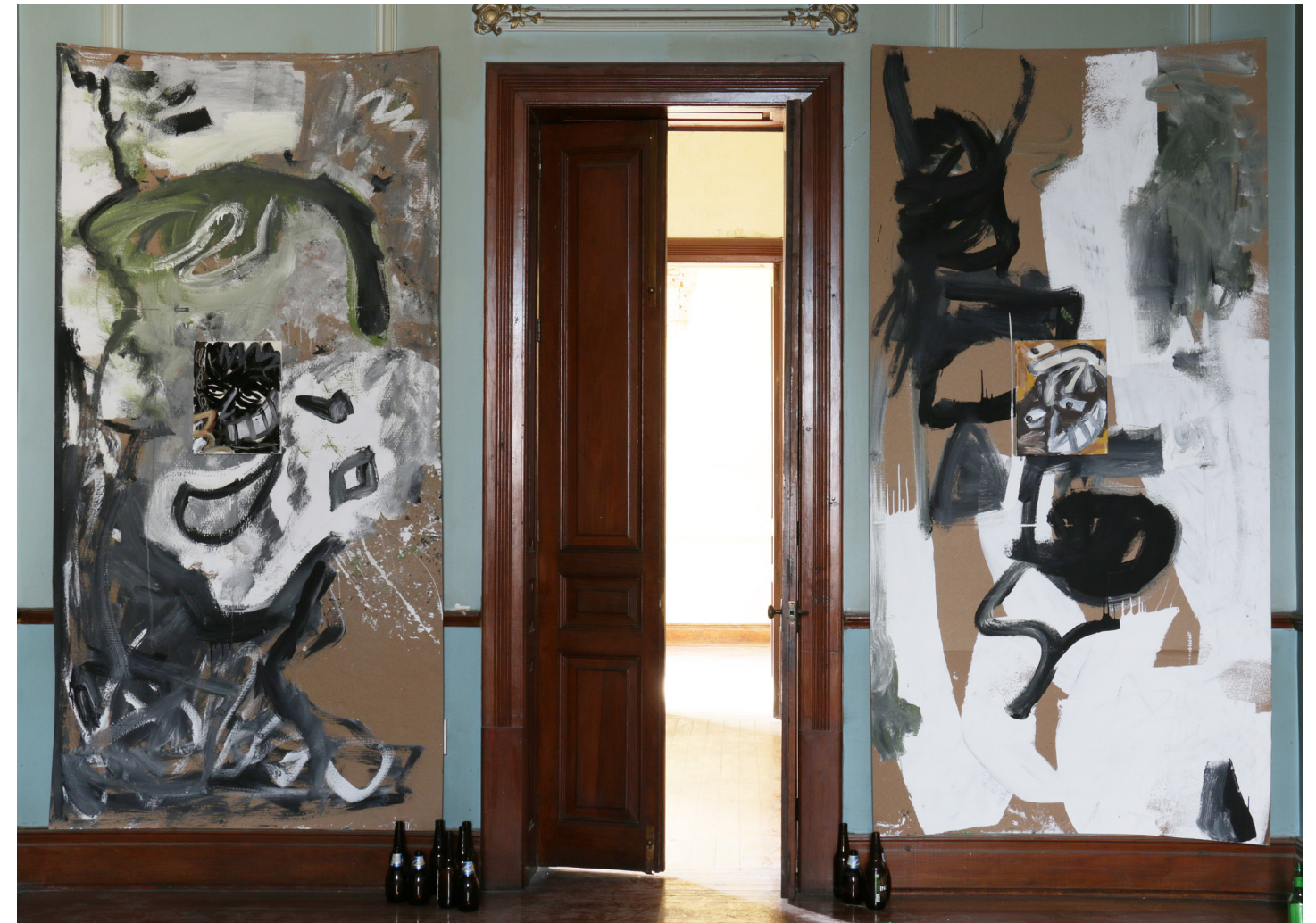
Black Palace Dancing Club, 2018 acrylic on cardboard and canvas, audio, concrete bricks, tequilla and beer dimensions variable