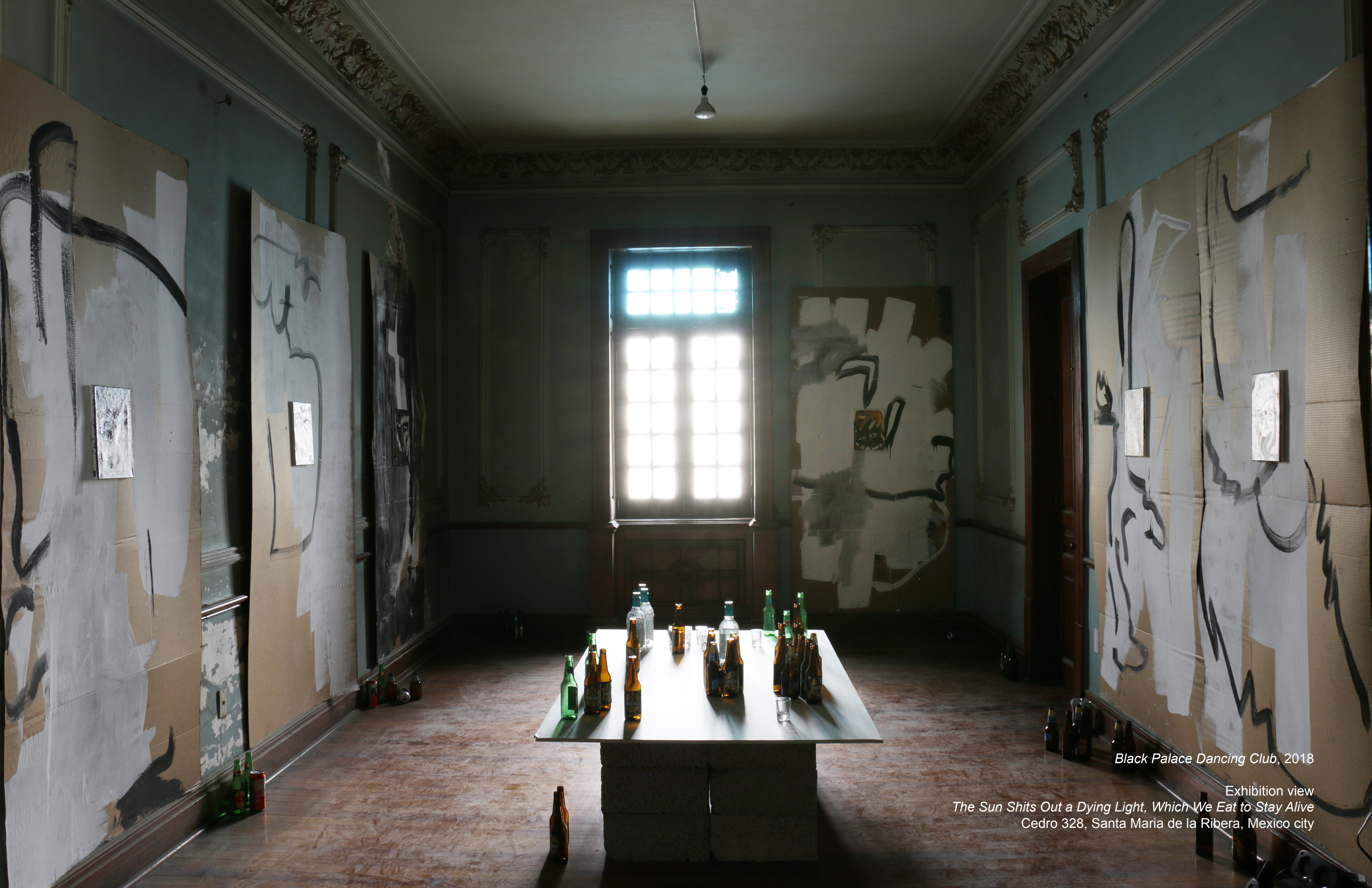
Black Palace Dancing Club, 2018