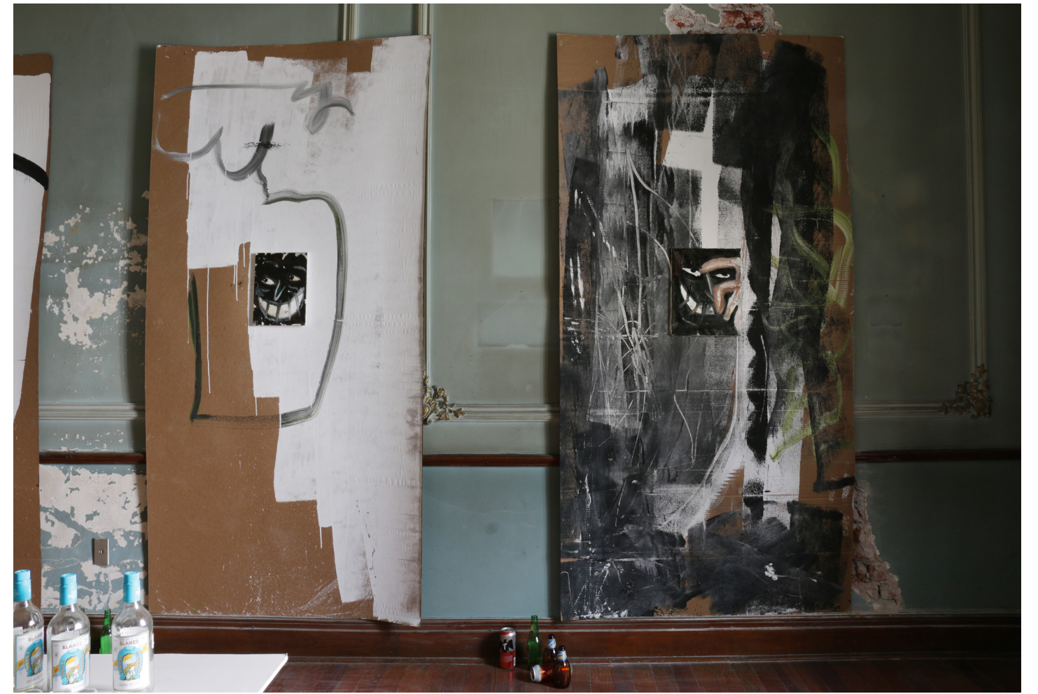
Black Palace Dancing Club, 2018 acrylic on cardboard and canvas, audio, concrete bricks, tequilla and beer dimensions variable