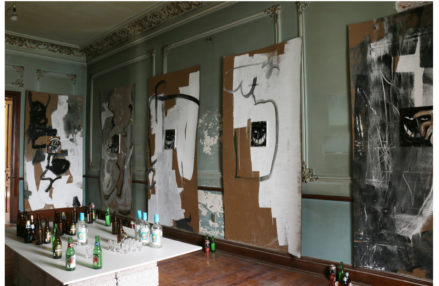
Black Palace Dancing Club, 2018 acrylic on cardboard and canvas, audio, concrete bricks, tequilla and beer dimensions variable