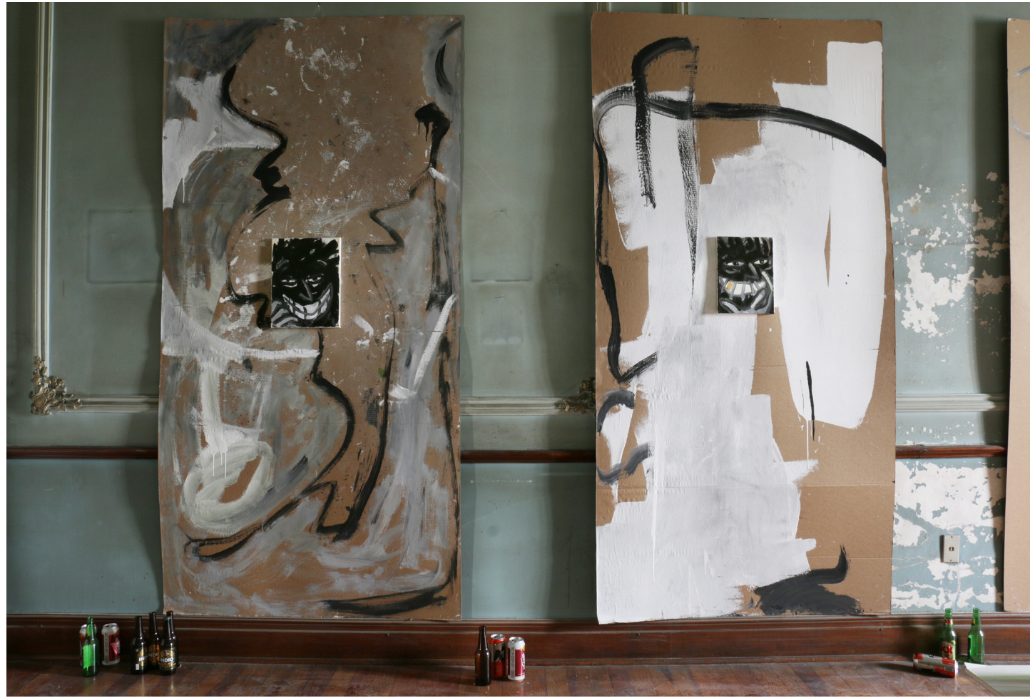
Black Palace Dancing Club, 2018 acrylic on cardboard and canvas, audio, concrete bricks, tequilla and beer dimensions variable