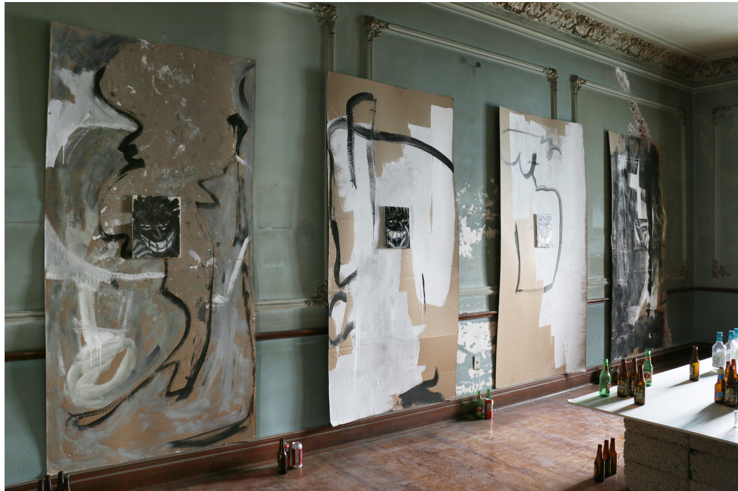
Black Palace Dancing Club, 2018 acrylic on cardboard and canvas, audio, concrete bricks, tequilla and beer dimensions variable