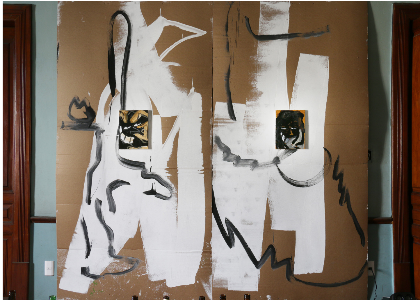
Untitled (Black Palace Dancing Club), 2018 acrylic on cardboard and canvas 220 x 140 cm