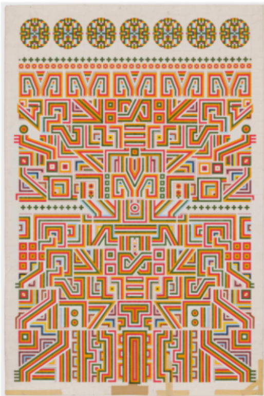
"THE PALACE OF ETERNITY" (2004), pencil and ink on found paper, 60 x 40 inches