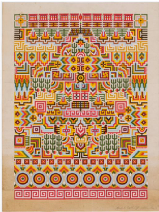
"HYPERION" (2004), pencil and ink on found paper, 42 x 30 inches