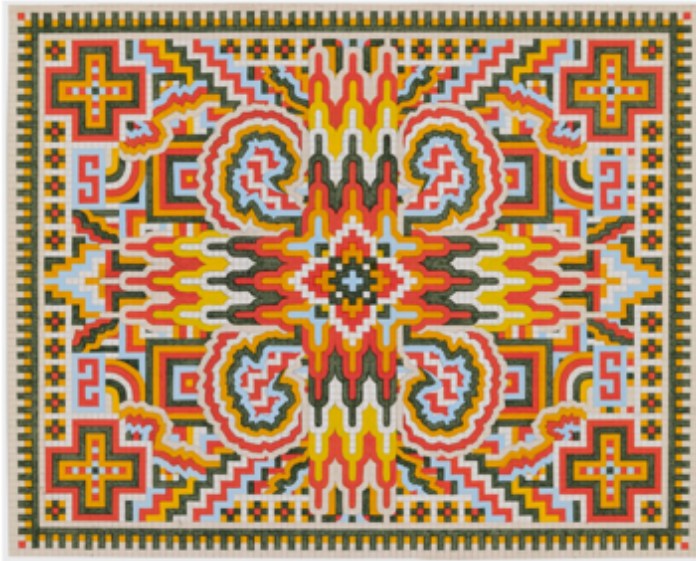
"STAR OF THE UNBORN" (2024), pencil and ink on found paper, 16 x 20 inches

Neuromancer is one of the first science-fiction novels characterized as cyberpunk, a dystopic mix of rapidly advanced technologies and mass societal collapse. Written by William Gibson and published in 1984, the book has become a cult classic lauded for how it doesn't reach toward a distant future but rather envisions " the real present ," a version of the stark inequities and nightmarish times we're already living in.