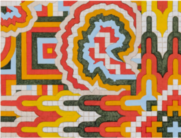
Detail of "STAR OF THE UNBORN" (2024), pencil and ink on found paper, 30 x 20 inches