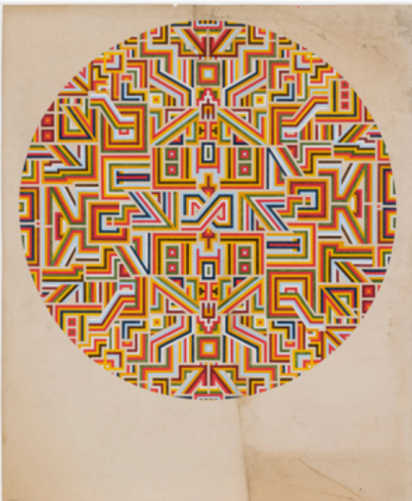
"CHAPTERHOUSE" (2024), pencil and ink on found paper, 48 x 40 inches