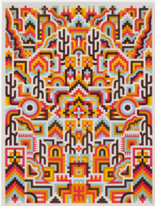
"NEUROMANCER" (2024), pencil and ink on found paper, 24 x 18 inches