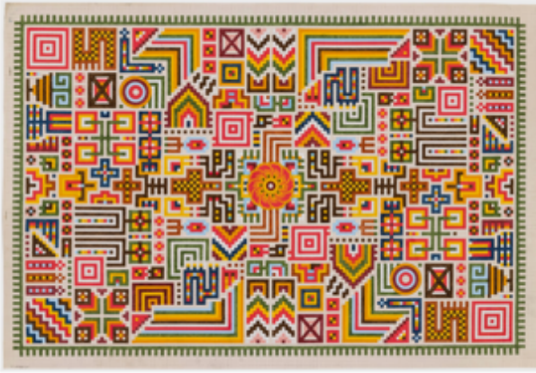
"MICROMEGAS" (2024), pencil and ink on found paper, 22.5 x 33 inches