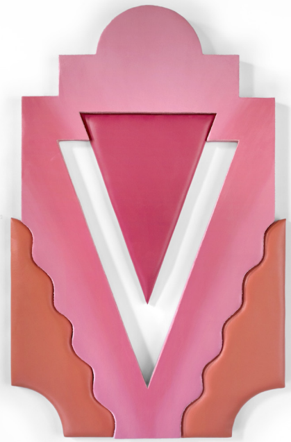
Dear Parvati , 2019 Acrylic, pumice stone, canvas, insulation board, and aluminum panel, 54h x 34w x 2d in