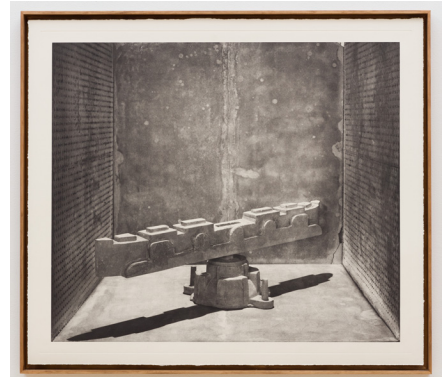
Rodrigo Valenzuela Stature No. 8, 2020 Photogravure 31h x 35.25w in Edition of 8 plus 4AP