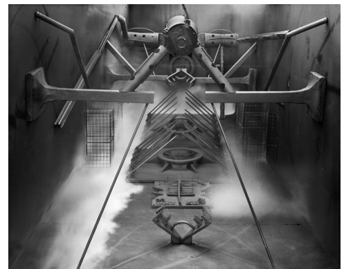
Rodrigo Valenzuela Afterwork #10, 2021 Silver Gelatin Print 24h x 30w in Edition of 3 + 1AP